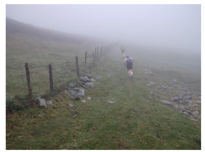
The climb up the fence